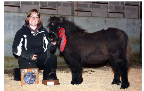
Champion Foal 2009 Sale, Lerwick

Saturday 1 st May – Aberdeen Spring Sale Friday 24 th September – Builth Sale Saturday 25 th September – York Sale Saturday 2 nd October – Carlisle Sale Thursday 7 th & Friday 8 th October – Lerwick Show & Sale Sunday 10 th & Monday 11 th October – Aberdeen Show & Sale Thursday 14 th October – Bridgewater Sale Tuesday 19 th & Wednesday 20 th October – Reading Show & Sale