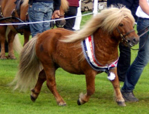
'Watzo of Berry' taking the title of supreme champion at the 2010 Viking Show

Apparently preparation is the key to organising anything, as we discovered the Viking Show is no exception to that rule! With all the rosettes sorted, trophies collected, weather booked and catalogues printed we were able to enjoy our first year in the driving seat of the Viking Show. A combination of a dry day, a good turnout of ponies and a super team of stewards, helpers, runners etc made it a really enjoyable experience and certainly one we would hope to repeat!