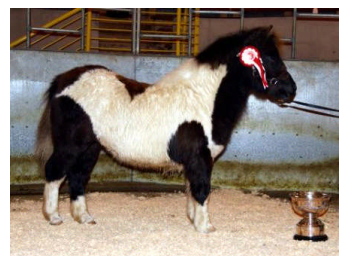
Champion Filly Foal 2010 Sale, Lerwick