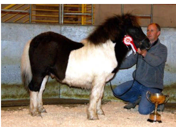
Champion Colt Foal 2010 Sale, Lerwick