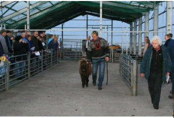
Outdoor Judging taking place at the 2010 Lerwick Sale

Having just arrived home at 10.45pm in the evening, I seriously wonder why I have all these ponies! I feel I must at least make a start on this article that I was kindly asked if I would write. The temperature outside is -6, I have spent all day at work and then three and a half hours feeding the Shetland ponies and sheep, it is taking a lot longer with icy conditions, taking extra care to avoid landing on my butt (cannot risk injury), and breaking ice on numerous water tanks.