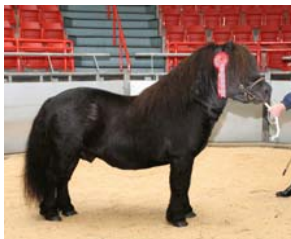
Standard Shetland Champion 2007 "Millhouse Excel" from Angus Howie Millhouse, Dunning, Perthshire

Sunday 5th October 2008 Monday 6th October 2008